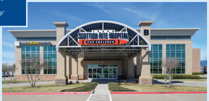
TSRHC's North Campus location in Plano

In addition to world-class sports medicine care, the North Campus location now offers general orthopedic services. To learn more about our North Campus location, at 7000 West Plano Parkway in Plano, visit scottishritehospital.org/sports or call 469-515-7100. ○