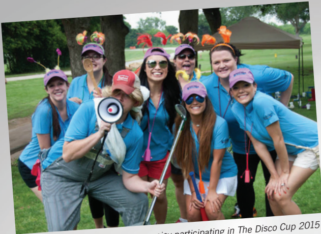
The Delta Companies employees enjoy participating in The Disco Cup 2015 Golf Tournament, which benefits the hospital.