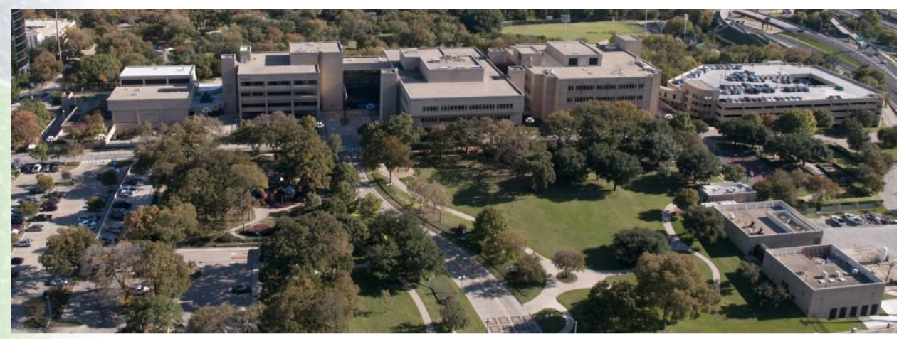
Texas Scottish Rite Hospital for Children • 2222 Welborn Street • Dallas, TX 75219

Name: Texas Scottish Rite Hospital for Crippled Children