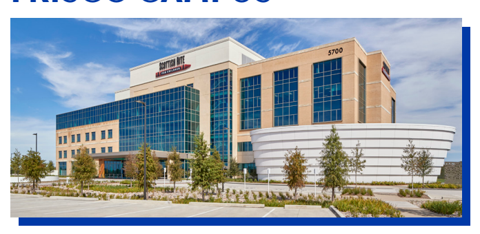
Northeast corner of Lebanon Road and the Dallas North Tollway.