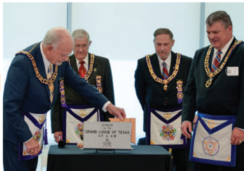
Sept. 19, 2018 Cornerstone Leveling