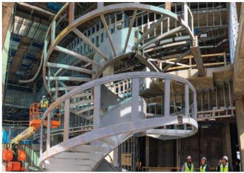
Dec. 2017 Monumental Spiral Staircase Frame