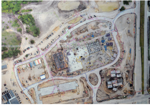
March 2017 Concrete Foundation