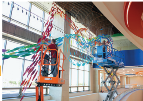
Sept. 2018 Atrium Art Installation