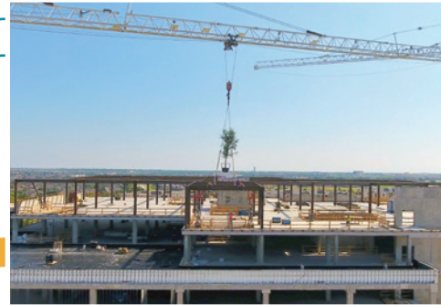
Sept. 2017 Topping Out Ceremony