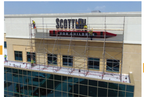
June 2018 Building Signage Installation