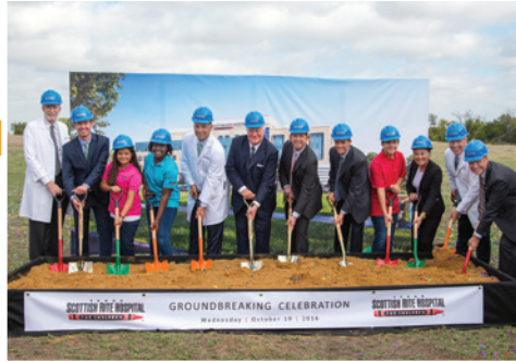
Oct. 2016 Groundbreaking Ceremony