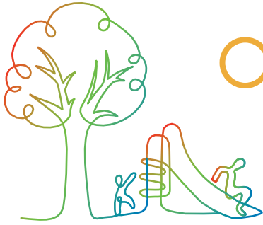
June 2014 Land Purchased