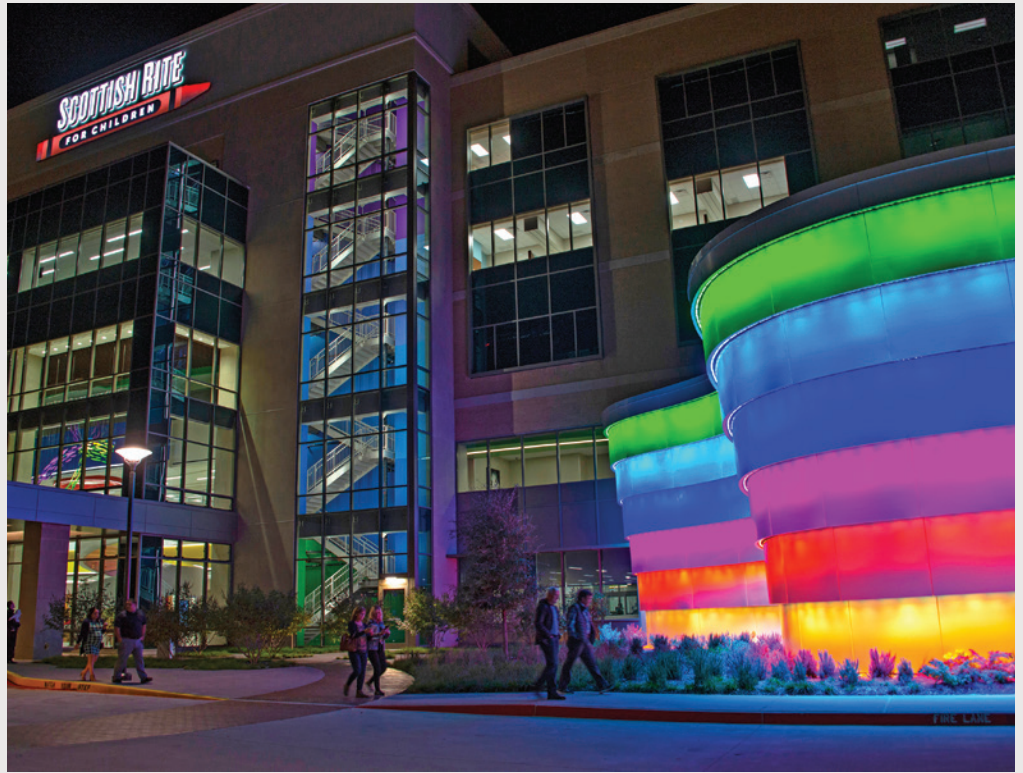
Pictured above: The "Rainbow Dragon," created by the Daniel Goldstein Studio, is suspended from the atrium ceiling; the facility's eye-catching, multi-hued spiral staircase; the donor wall, which celebrates our supporters with an array of vibrant colors and (at right) the colorful exterior of the Frisco facility lights up the night sky.