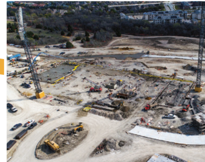
Nov. 2016 Construction Begins