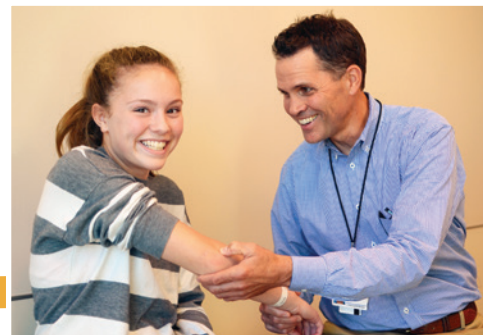
Oct. 10, 2018 Doors Open To Patients