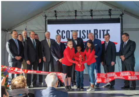
Oct. 25, 2018 Ribbon Cutting Ceremony and Grand Opening Celebration