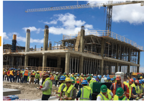
April 2017 Going Vertical